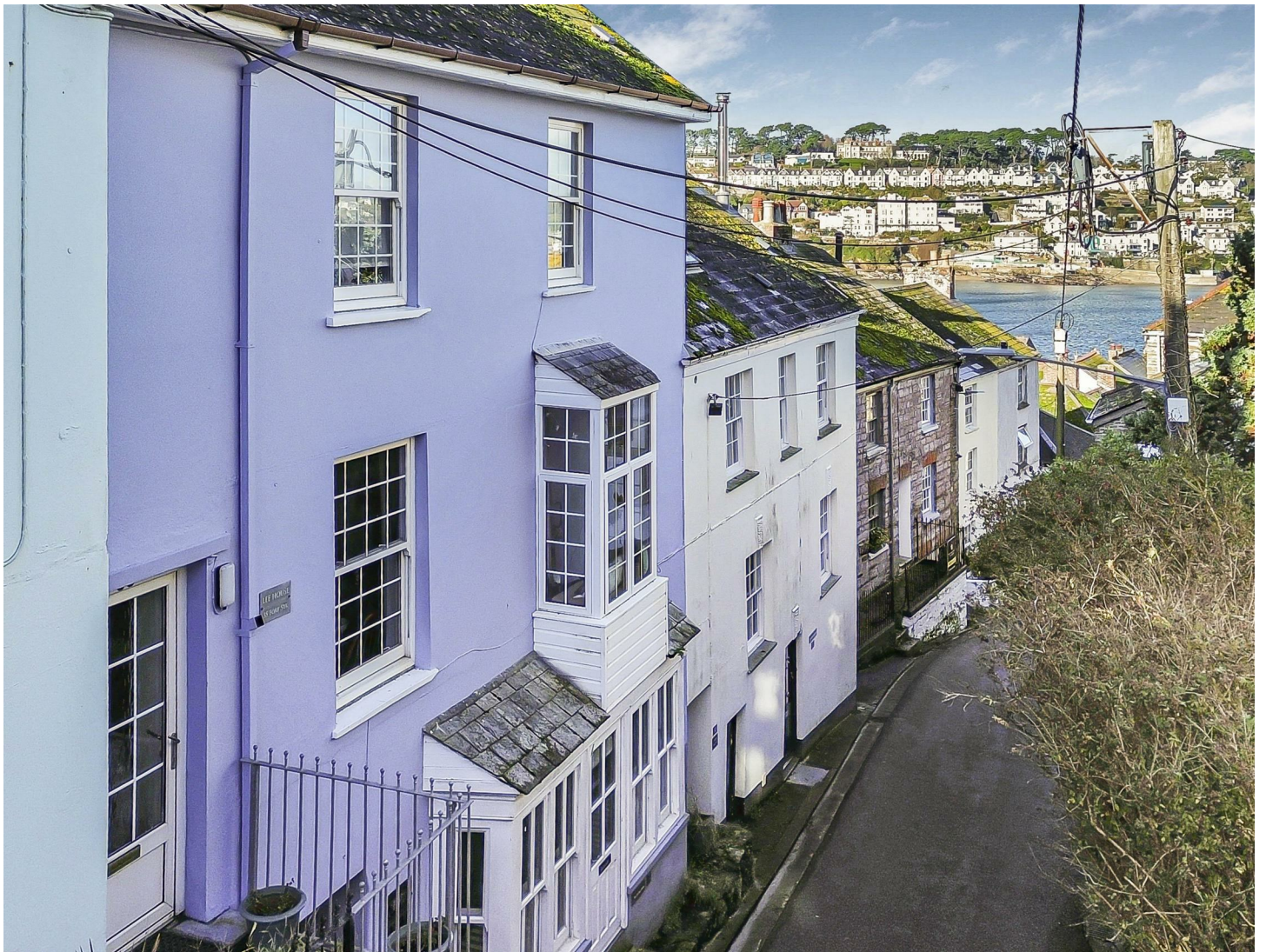
The Old Post Office